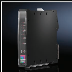
► IoT Interface compatible