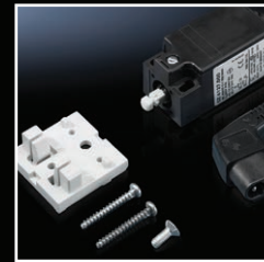
► Door Switch