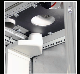
► Air Duct System