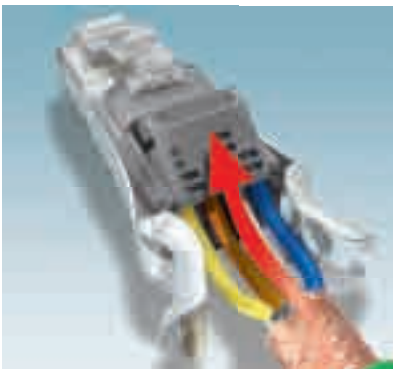
1. Feed in the conductors