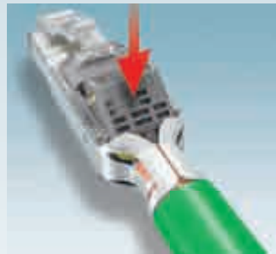
3. Close the wiring flaps – Done!