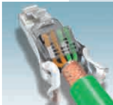
2. Cut the conductors flush